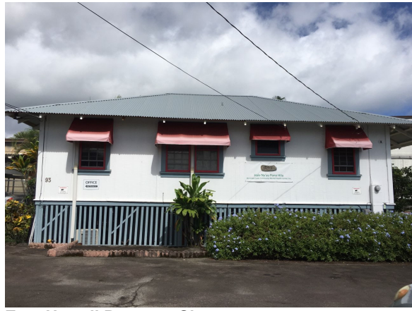
East Hawaii Program Site